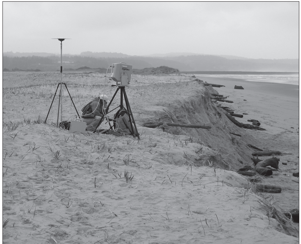
All 3D scans are geo-referenced