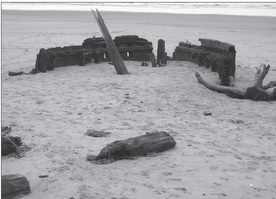
Visible bow portions of the George Olson

Our survey mission was to obtain a 3D high definition laser scan of those parts of the ship that were recently exposed. Time was critical—the wreck was in snowy plover habitat and the beach closes to vehicular traffic on March 15. The resident snowy plover gets to have a break from the tourists during the summer nesting season. The beach wouldn't