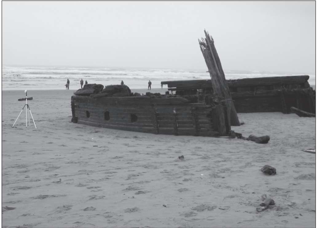
Bow portion—note the scan target to the left.

And in the can it is. A fully modeled, non-destructive, geo-referenced 3D high definition laser scan of the bow of the George Olson as was exposed on March 13, 2008. Now is that exciting or what? In 1917 a photographer took a picture of the ship in the Oakland shipyard and probably said much the same thing. Lo and behold, it was that photograph that helped identify the George Olson some 91 years later. To find that photo was exciting and provided the key to the Coos Bay mystery ship. I'll give it another 91 years and see if anyone gets excited about our 3D scan picture. In the meantime we're off scouring the coast for more shipwrecks. If anyone has a need for the George Olson 3D data before 2099 rolls around we'd love to talk about it. ◉